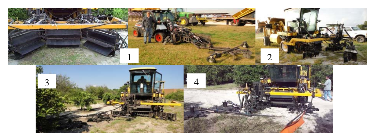
Fig. 2. The modified Oxbo 3200: 1. flap-wheel. 2. centipede. 3. combination centipede and wheel-sweep. 4. wheel-sweep.